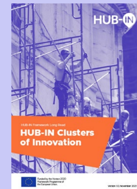
HUB-IN Clusters of Innovation

This document focuses on HUB-IN Alignment with European and International Policy. It is one of three Long Reads related to elements of the HUB-IN Framework. You can also find: