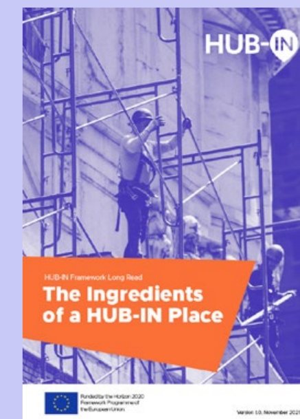
The Ingredients of a HUB-IN Place