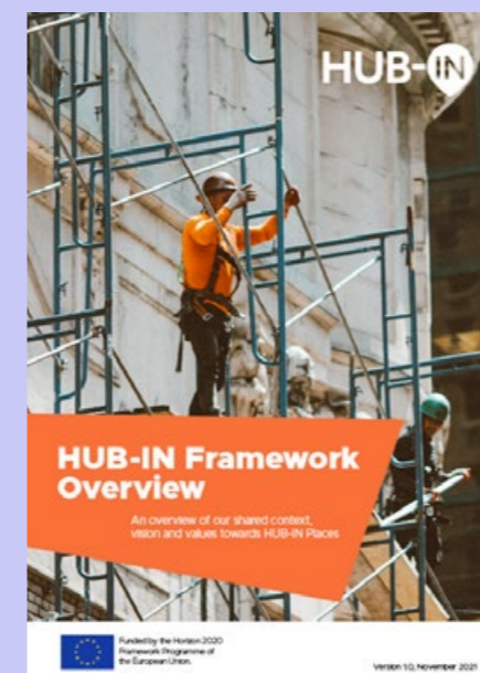
HUB-IN Framework Overview

For information on the framework as a whole, please read the HUB-IN Framework Overview .